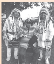
Peo-Peo-Mox-Mox (Walla Walla Chief Donald Sampson)